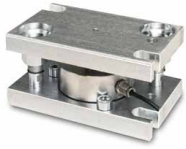
Fig. shows accessories, load corner 1 SAUTER CE Q42901, for further accessories please visit our online shop